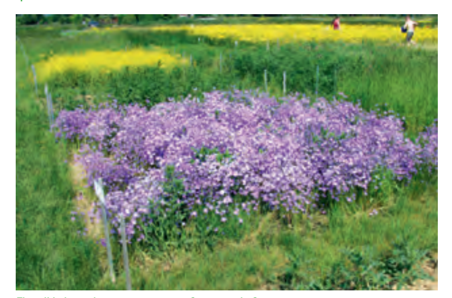
The wild plants that were sown came from a pool of 60 typical species and were assigned to four functional groups.

- particularly its productivity. The data did indeed show a significant positive relationship between the number of plant species and the production of biomass. The researchers still do not know how this effect comes about.