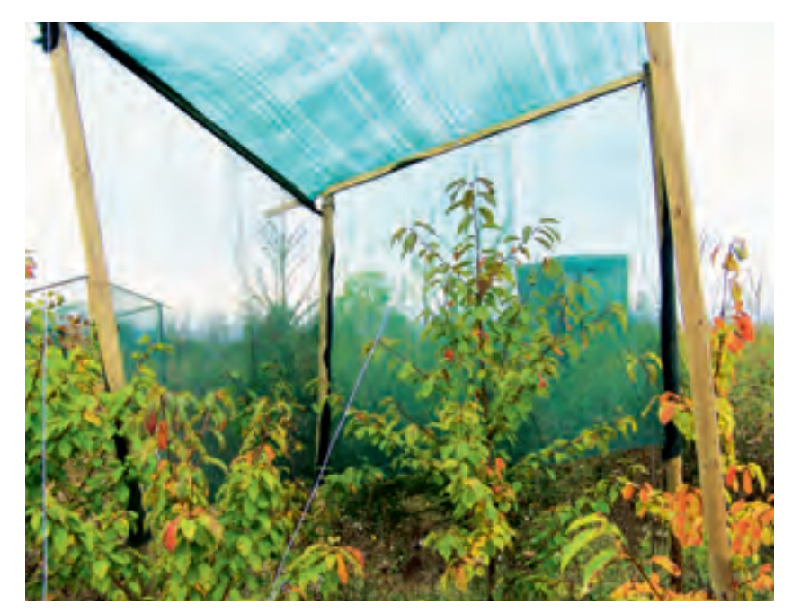
The researchers want to use artificial shade covers to find out how trees compete for light, and how they redistribute their resources internally.