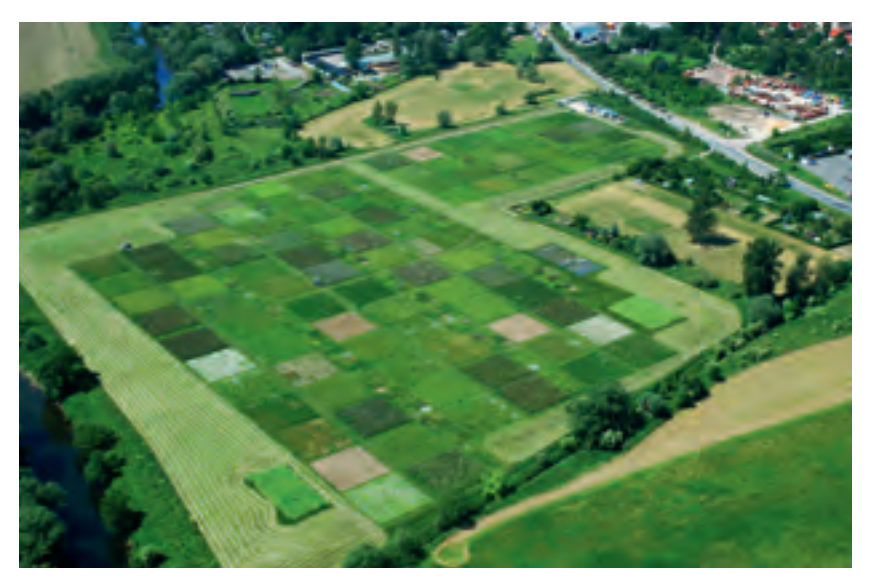
In the Jena experiment, more than 480 sections of meadow with different species combinations were created in an area the size of ten soccer fields.