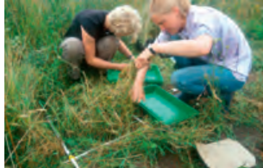
Researchers measure the hay yield: Areas with less plant diversity yield less biomass.

However, the extremely dry summer of 2003 caused us considerable problems when we planted the small trees, which were 20 - 60 centimeters in height. We lost all of the very small pine trees at one of the three locations, and two-thirds of the newly planted European beeches and sessile oaks also died. However, it was easier to establish the wych elms, the small-leaved limes, the ashes and the rowans and the three different species of maple - losses here totaled less than 20 percent. We thus had to reach for our spades again the fol-