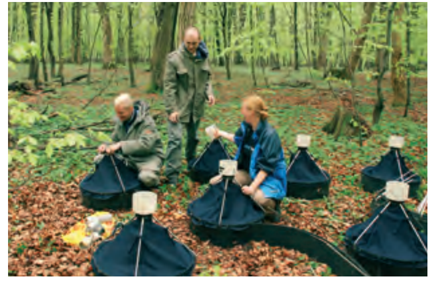
Hainich National Park is one of the three sites for the exploratories. There, arthropods develop as Larvae in the ground; zoologists install traps to catch them.

stable than species-poor stands. Accordingly, even in young afforestation projects, such injurious factors as gnawing by water voles or rabbits should cause less damage to speciesrich stands than in monocultures. We therefore monitored how successfully 19 different tree species in the BIOTREE experiment had grown in the first two years after planting. We were able to attribute up to 20 percent of losses in one tree species to water vole damage. These small rodents usually dig extensive passages directly under the plants, and are particularly fond of eating the roots of young trees. The tree species we investigated were affected to differing extents: we found the most damage by water voles on oaks in all the locations, whereas the lime trees remained practically unaffected.